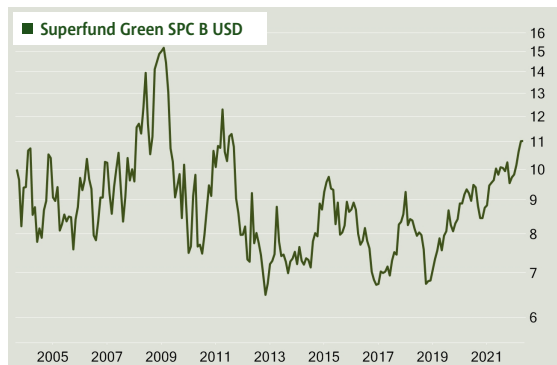
logarithmic scale source: Superfund; period: 10/01/2003 - 05/31/2022