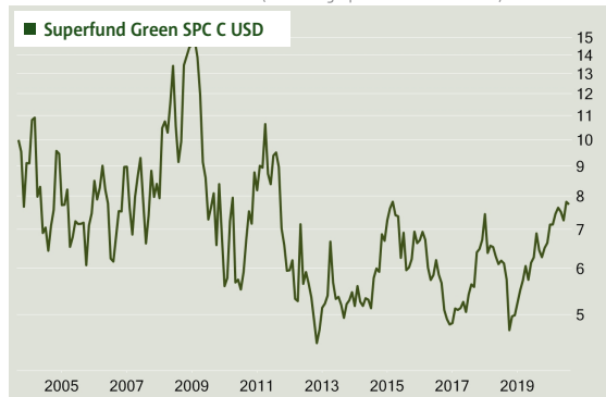
logarithmic scale ; period: 10/01/2003 - 08/31/2020